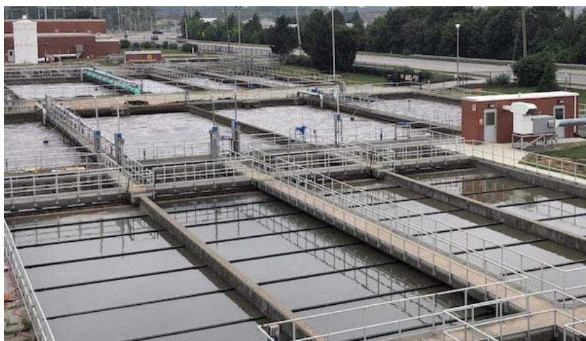
Image: Carmel Indiana, was one of the first wastewater plants to test for Covid-19 in the community.

https://www.cbsnews.com/news/covid-19-wastewater-monitoring-program-cdc/